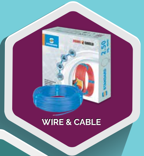
WIRE & CABLE