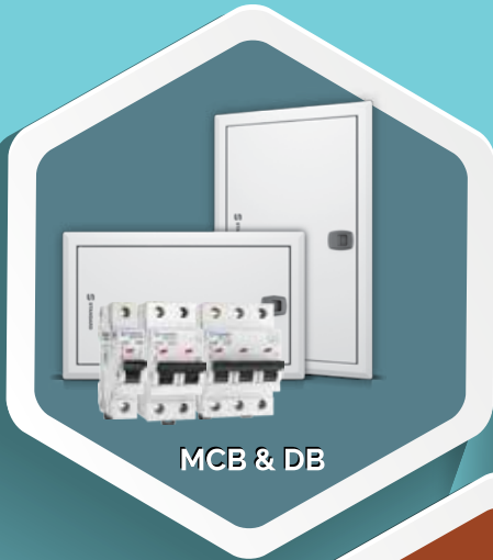
MCB & DB